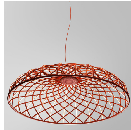
Shown in brick red

COLOR RENDERING 90 CRI LAMP COLOR 2700K LUMENS/WATT 24.77 LUMINOUS FLUX 1932 lumens