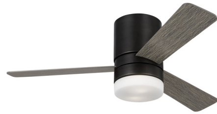
Shown in aged pewter / light grey weathered oak / matte opal

LAMP LIFE . . . . . 50000 hours COLOR RENDERING . . . . . 90 CRI LAMP COLOR . . . . . 3000K LUMENS/WATT . . . . . 88.89 LUMINOUS FLUX . . . . . 800 lumens