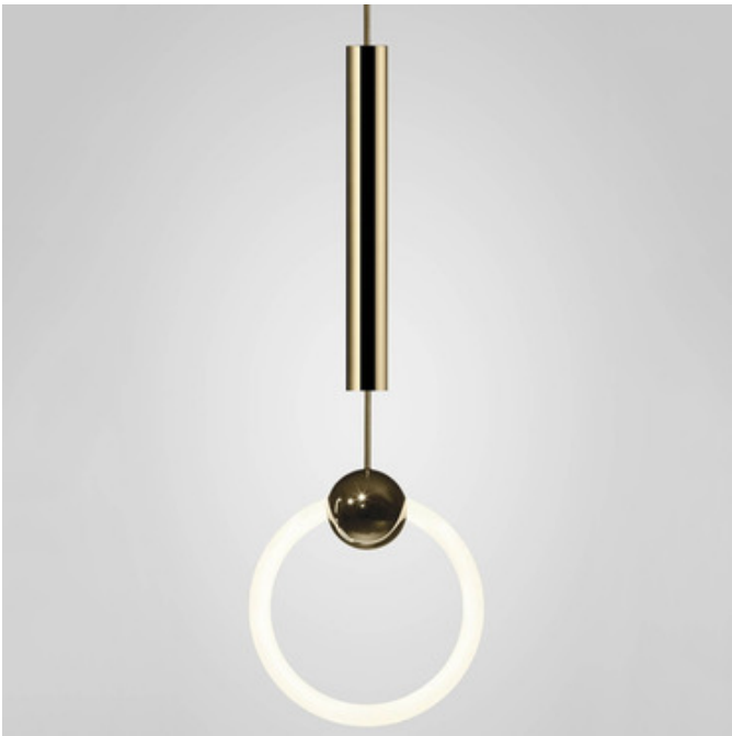
Shown in: Polished Gold / Opal

The Ring Pendant, one of Lee Broom's iconic designs, has been revamped and reintroduced with a fully integrated LED light source. The pendant features a circular opal glass diffuser intersecting a metal sphere in polished gold finish. A metal cylinder above the light source provides a decorative accent and adds a vertical element to the design. Whether displayed on its own or in a grouping of multiple pendants, Ring's elegant simplicity will enhance any interior. Supplied with integrated LED driver. Dimmable with TRIAC / Leading Edge dimmers.