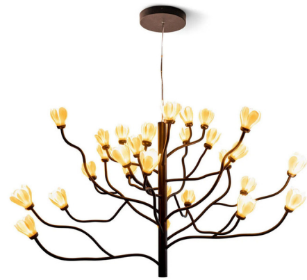
Shown in black / porcelain