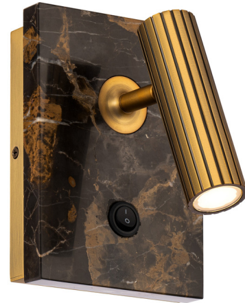
Shown in aged brass

The Nexus Wall Sconce offers a taste of classic style with its smooth black and gold marble accent plate and elegantly ribbed slim light head. Each piece displays unique veining and natural color variation. For adjusting light direction, the articulating light can rotate 330 degrees horizontally and 90 degrees vertically. The on/off toggle switch is conveniently located on the backplate, along with a USB port for charging your devices.