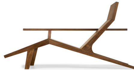
Shown in walnut

Joep van Lieshout conceived the Liberty Lounger as part of his Prototypes project, a series of chairs that explored the relationship between creators and their materials and the value of raw, hand production. These ideas are reflected in Liberty's clean-lined, angular silhouette crafted from solid American walnut. An elongated armrest along the right side of the chair doubles as a side table. Liberty also includes a soft sheepskin which can be used as a seat cushion. As much a sculptural object as a functional furniture piece, Liberty will make a bold statement in a modern interior.