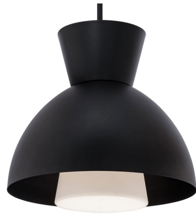
Shown in black / white

LAMP LIFE . . . . . 50000 hours COLOR RENDERING . . . . . 90 CRI LAMP COLOR . . . . . 3000K LUMENS/WATT . . . . . 26.93 LUMINOUS FLUX . . . . . 781 lumens