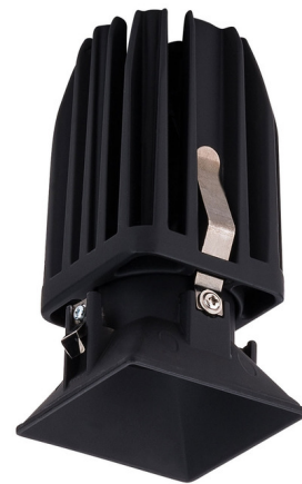
Shown in black

APERTURE SHAPE . . . . . Square CEILING TYPE . . . . . Drywall Trimless/Flush FUNCTION . . . . . Downlight LAMP LIFE . . . . . 50000 hours BEAM ANGLE . . . . . 40° COLOR RENDERING . . . . . 90 CRI LAMP COLOR . . . . . 3500K LUMENS/WATT . . . . . 79.60 LUMINOUS FLUX . . . . . 1990 lumens