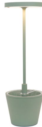
Shown in sage green

COLOR RENDERING 80 CRI LAMP COLOR CCT Select LUMENS/WATT 113.91 LUMINOUS FLUX 262 lumens