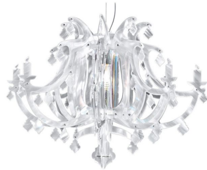
Shown in prism

Ginetta Prisma Suspension features an eight-branch frame made of Lentiflex polycarbonat in gold, white, black, silver or prisma finish options.