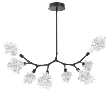
Shown in matte black / clear

COLOR RENDERING . . . . . 90 CRI LAMP COLOR . . . . . 2700K LUMENS/WATT . . . . . 553.85 LUMINOUS FLUX . . . . . 1440 lumens