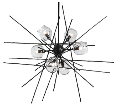
Shown in black / clear

The Griffin Starburst Pendant brings an organic vibe to your interior space with its unique hand blown thumbprint glass shades. The hammered steel rods are created to look like the tree bark of intersecting twigs. Includes One 3 inch, One 6 inch, and Three 12 inch rods to customize length. Sloped ceiling adaptable to 45 degrees. Lifetime Limited Warranty when installed in residential setting. Handcrafted to order by skilled artisans in the USA.