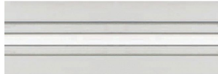
Shown in satin nickel / clear insulator

Hand bendable, field-cuttable Monorail is rated for 300 watts at 12 volts, 600 watts at 24 volts. Each piece of rail is shipped with conductive connectors to join rail pieces end to end. Order additional connectors (sold separately) if cutting and rejoining rails. Finish in Antique Bronze with Brown Insulator, Antique Bronze with Clear Insulator, or Satin Nickel with Clear Insulator. ETL listed. Available in 24, 48 and 96 inch lengths. 0.3 inch width x 0.6 inch height.