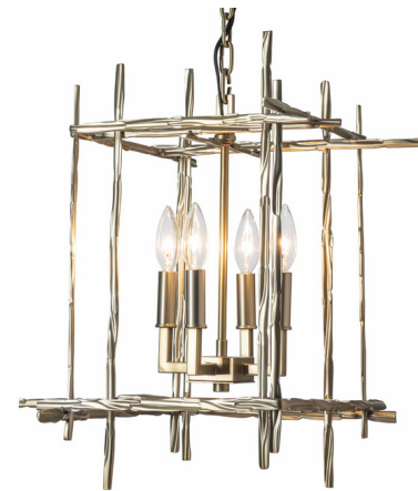
Shown in modern brass

PRODUCT DIMENSIONS . . . . . Adjustable Chain Length: 36"