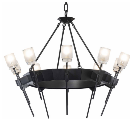
Shown in black / cast glass

The Echo Chandelier gives the illusion of a scepter between two hand forged steel plates. Slender steel tubes hold a glass diffuser, casting warm shadows across your room. Sloped ceiling adaptable. Lifetime Limited Warranty when installed in residential setting. Handcrafted to order by skilled artisans in Vermont, USA.