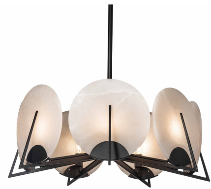
Shown in black / alabaster

The Callisto Pendant adds an overstated beauty to your interior space. The circular frame, with stabilizing times, hold elegant Alabaster discs from Spain, casting warm shadows across your room. Sloped ceiling adaptable to 45 degrees. Handmade to order by skilled artisans in Vermont, USA. Lifetime limited warranty. Note: Alabaster is a natural material and comes in a wide variety of color and marks. No two pieces are the same.