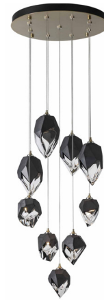
Shown in modern brass / black crystal

PRODUCT DIMENSIONS . . . . . Min/Max Adjustable Length: 15" - 80"