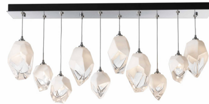
Shown in sterling / white crystal

The Chrysalis Mixed Linear Multi Light Pendant is like a jewel for your home. Small and large thick clear glass encased in a an outer layer of hand blown colored glass, casting warm shadows across your room. Each pendant can be individually adjusted for your own unique look. Limited Warranty when installed in residential setting. Handcrafted to order by skilled artisans in Vermont, USA. Note: Due to the weight of this fixture, additional ceiling support is required.