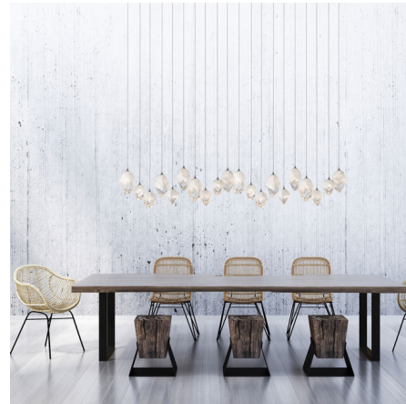
Shown in sterling / white crystal

The Chrysalis Mixed Linear Multi Light Pendant is like a jewel for your home. Small and large thick clear glass encased in a an outer layer of hand blown colored glass, casting warm shadows across your room. Each pendant can be individually adjusted for your own unique look. Limited Warranty when installed in residential setting. Handcrafted to order by skilled artisans in Vermont, USA. Note: Due to the weight of this fixture, additional ceiling support is required.