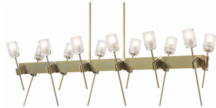
Shown in modern brass / cast glass