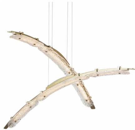
Shown in modern brass / clear

PRODUCT DIMENSIONS . . . . . Min/Max Adjustable Length: 20" - 100" LAMP LIFE . . . . . 30000 hours COLOR RENDERING . . . . . 90 CRI LAMP COLOR . . . . . 3000K LUMENS/WATT . . . . . 138.89 LUMINOUS FLUX . . . . . 1500 lumens