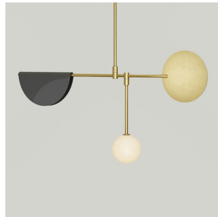
Shown in brushed brass

PRODUCT DIMENSIONS . . . . . Canopy: 5" diameter LAMP LIFE . . . . . 15000 hours COLOR RENDERING . . . . . 90 CRI LAMP COLOR . . . . . 2700K LUMENS/WATT . . . . . 110.00 LUMINOUS FLUX . . . . . 220 lumens