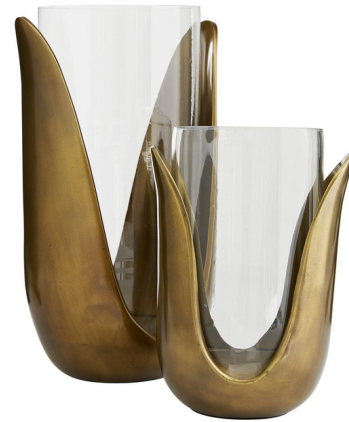
Shown in antique brass / clear

The Sonia Vase brings a regal flare with a botanical twist. A Clear Glass sleeve rests inside the petals of cast aluminum tulips to give a natural beauty and organic lines. Leave empty or fill with your favorite things.