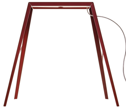
Shown in dark red

COLOR RENDERING . . . . . 90 CRI LAMP COLOR . . . . . 2700K LUMENS/WATT . . . . . 100.00 LUMINOUS FLUX . . . . . 340 lumens