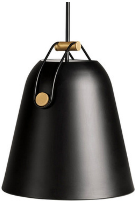
Shown in: Black / Matte Gold

Distinctive detailing found on the Napa Pendant makes it a welcome addition in modern kitchens and dining areas. The gently flared steel shade is held by a stylish steel wire support that hooks onto two protruding buttons and loops over the shade. Alone or in combination with other elements, the Napa offers sleek, functional lighting that harmonizes with any space.