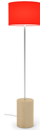
Shown in maple stained veneer / red

The Stretch Floor Lamp brings a bright, bold, burst of light to your interior space. The The wood veneer body is finished and topped with a clean fabric shade, casting warm shadows across your room. On/Off switch is located on the cord.