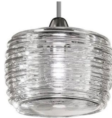
Shown in satin nickel / crystal