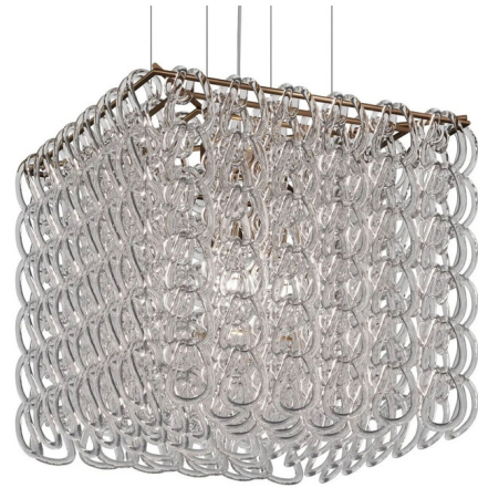
Shown in matte bronze / transparent

Originally conceived in 1967 by Angelo Mangiarotti, the Giogali Cube Pendant derives both its name and shape from the Italian word giogher, referring to the rope used to tie a horse or ox-driven cart to the yoke. The pendant is composed of a multitude of small, rope-like crystal hooks, which are linked together to form a net of glistening glass. The crystal is draped around the light's frame, obscuring the light source and creating a gleaming cascade of light. With its delicate and glamorous aesthetic, Giogali will enhance any interior with an elegant sparkle. Note: Due to the weight of the fixture, additional ceiling support is required.