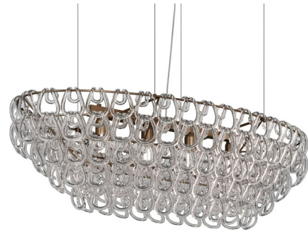
Shown in matte bronze / transparent

Originally conceived in 1967 by Angelo Mangiarotti, the Giogali Oval Linear Pendant derives both its name and shape from the Italian word giongher, referring to the rope used to tie a horse or ox-driven cart to the yoke. The pendant is composed of a multitude of small, rope-like crystal hooks, which are linked together to form a net of glistening glass. The crystal is wrapped around the pendant's oval frame, obscuring the light source and creating a gleaming cascade of light. With its delicate and glamorous aesthetic, Giogali will enhance any interior with an elegant sparkle. Note: Due to the weight of the fixture, additional ceiling support is required.