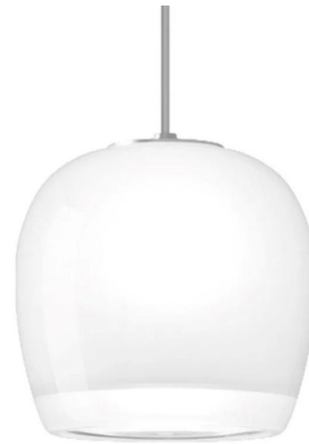
Shown in white / white crystal