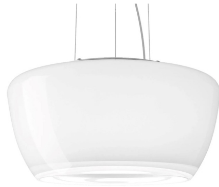
Shown in white / white crystal

LAMP COLOR . . . . . 2700K LUMENS/WATT . . . . . 189.74 LUMINOUS FLUX . . . . . 3700 lumens