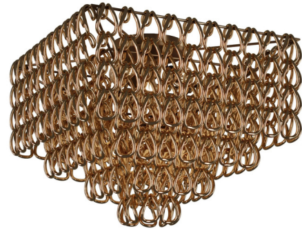
Shown in matte bronze / gold

Originally conceived in 1967 by Angelo Mangiarotti, the Minigiogali Square Ceiling Light derives both its name and shape from the Italian word giongher, referring to the rope used to tie a horse or ox-driven cart to the yoke. The fixture is composed of a multitude of small, rope-like crystal hooks, which are linked together to form a net of glistening glass. The crystal is draped around the light's frame, obscuring the light source and creating a gleaming cascade of light. With its delicate and glamorous aesthetic, Minigiogali will enhance any interior with an elegant sparkle.