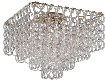
Shown in matte bronze / transparent

Originally conceived in 1967 by Angelo Mangiarotti, the Minigiogali Square Ceiling Light derives both its name and shape from the Italian word giongher, referring to the rope used to tie a horse or ox-driven cart to the yoke. The fixture is composed of a multitude of small, rope-like crystal hooks, which are linked together to form a net of glistening glass. The crystal is draped around the light's frame, obscuring the light source and creating a gleaming cascade of light. With its delicate and glamorous aesthetic, Minigiogali will enhance any interior with an elegant sparkle.