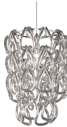
Shown in chrome / silver

Originally conceived in 1967 by Angelo Mangiarotti, the Minigiogali Pendant derives both its name and shape from the Italian word giongher , referring to the rope used to tie a horse or ox-driven cart to the yoke. The pendant is composed of a multitude of small, rope-like crystal hooks, which are linked together to form a net of glistening glass. The crystal is draped around the light's frame, obscuring the light source and creating a gleaming cascade of light. With its delicate and glamorous aesthetic, Minigiogali will enhance any interior with an elegant sparkle.