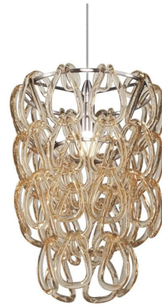
Shown in chrome / amber

Originally conceived in 1967 by Angelo Mangiarotti, the Minigiogali Pendant derives both its name and shape from the Italian word giongher, referring to the rope used to tie a horse or ox-driven cart to the yoke. The pendant is composed of a multitude of small, rope-like crystal hooks, which are linked together to form a net of glistening glass. The crystal is draped around the light's frame, obscuring the light source and creating a gleaming cascade of light. With its delicate and glamorous aesthetic, Minigiogali will enhance any interior with an elegant sparkle.