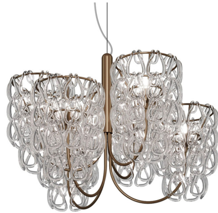
Shown in matte bronze / transparent

Originally conceived in 1967 by Angelo Mangiarotti, the Minigiogali Chandelier derives both its name and shape from the Italian word giongher, referring to the rope used to tie a horse or ox-driven cart to the yoke. The chandelier is composed of a multitude of small, rope-like crystal hooks, which are linked together to form a net of glistening glass. The crystal is draped from the light's curving arms, obscuring the light source and creating a gleaming cascade of light. With its delicate and glamorous aesthetic, Minigiogali will enhance any interior with an elegant sparkle.