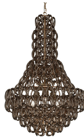
Shown in matte bronze / bronze

Originally conceived in 1967 by Angelo Mangiarotti, the Minigiogali Classic Pendant derives both its name and shape from the Italian word giongher, referring to the rope used to tie a horse or ox-driven cart to the yoke. The pendant is composed of a multitude of small, rope-like crystal hooks, which are linked together to form a net of glistening glass. The crystal is draped around the light's frame, a classic Art Deco-style silhouette, obscuring the light source and creating a gleaming cascade of light. With its delicate and glamorous aesthetic, Minigiogali will enhance any interior with an elegant sparkle.