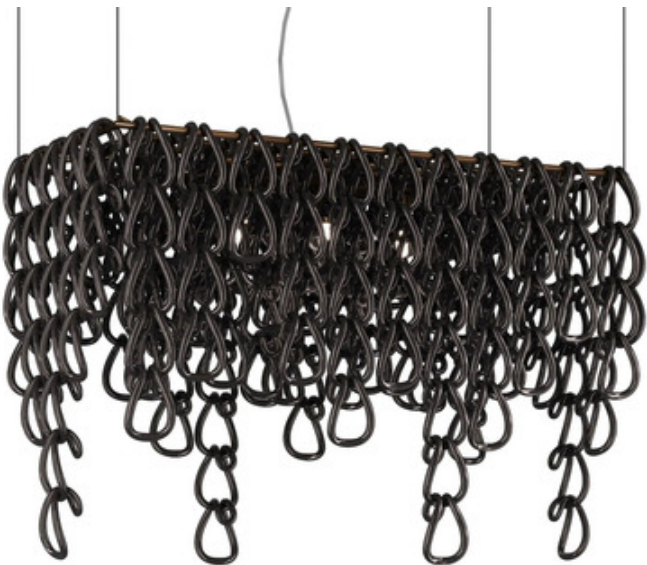
Shown in: Matte Bronze / Black

Originally conceived in 1967 by Angelo Mangiarotti, the Minigiogali Cloud Pendant derives both its name and shape from the Italian word giongher, referring to the rope used to tie a horse or ox-driven cart to the yoke. The pendant is composed of a multitude of small, rope-like crystal hooks, which are linked together to form a net of glistening glass. Strands of crystal are draped around the fixture in a rectangular structure, obscuring the light source and creating a gleaming cascade of light. With its delicate and glamorous aesthetic, Giogali will enhance any interior with an elegant sparkle.