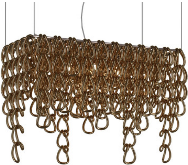
Shown in: Chrome / Gold

Originally conceived in 1967 by Angelo Mangiarotti, the Minigiogali Cloud Pendant derives both its name and shape from the Italian word giongher, referring to the rope used to tie a horse or ox-driven cart to the yoke. The pendant is composed of a multitude of small, rope-like crystal hooks, which are linked together to form a net of glistening glass. Strands of crystal are draped around the fixture in a rectangular structure, obscuring the light source and creating a gleaming cascade of light. With its delicate and glamorous aesthetic, Giogali will enhance any interior with an elegant sparkle.