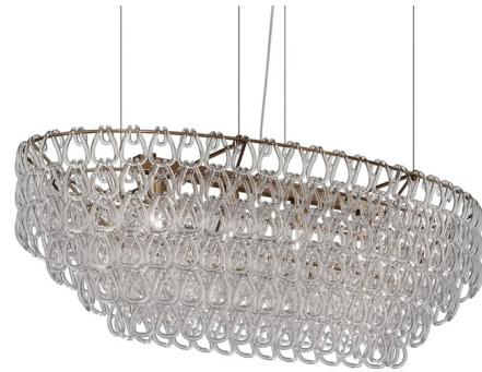
Shown in matte bronze / transparent

Originally conceived in 1967 by Angelo Mangiarotti, the Minigiogali Oval Linear Pendant derives both its name and shape from the Italian word giongher, referring to the rope used to tie a horse or ox-driven cart to the yoke. The pendant is composed of a multitude of small, rope-like crystal hooks, which are linked together to form a net of glistening glass. The crystal is wrapped around the pendant's oval frame, obscuring the light source and creating a gleaming cascade of light. With its delicate and glamorous aesthetic, Minigiogali will enhance any interior with an elegant sparkle. Note: Due to the weight of the fixture, additional ceiling support is required.