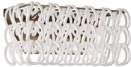
Shown in matte bronze / white

Originally conceived in 1967 by Angelo Mangiarotti, the Giogali Wall Sconce derives both its name and shape from the Italian word giogher, referring to the rope used to tie a horse or ox-driven cart to the yoke. The sconce is composed of a multitude of small, rope-like crystal hooks, which are linked together to form a net of glistening glass. The crystal is draped around the sconce in a rectangular structure, obscuring the light source and creating a gleaming cascade of light. With its delicate and glamorous aesthetic, Giogali will enhance any interior with an elegant sparkle.