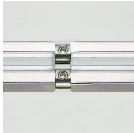
Shown in satin nickel

This is a pair of Monorail Conductive Connectors for joining sections of Tech Lighting Monorail rails end to end. Connectors are included with all Monorail pieces; this additional pair can be used if cutting and rejoining rails.