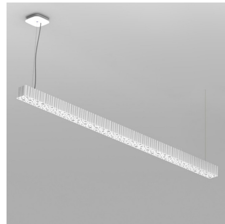
Shown in white

LAMP LIFE . . . . . 50000 hours COLOR RENDERING . . . . . 90 CRI LAMP COLOR . . . . . 3000K LUMENS/WATT . . . . . 69.42 LUMINOUS FLUX . . . . . 2985 lumens