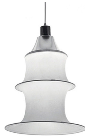
Shown in aluminum / white

COLOR . . . . . White BODY FINISH . . . . . Aluminum WATTAGE . . . . . 8W DIMMER . . . . . Low Voltage Electronic DIMENSIONS . . . . . 15.75"W x 20.875"H BULB NOT INCLUDED . . . . . 1 x T10/Medium (E26)/8W/120V LED OTHER BULB OPTIONS . . . . . 1 x T10/Medium (E26)/60W/120V Incandescent COUNTRY OF ORIGIN . . . . . Italy