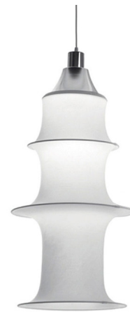
Shown in aluminum / white

COLOR . . . . . White BODY FINISH . . . . . Aluminum WATTAGE . . . . . 8W DIMMER . . . . . Low Voltage Electronic DIMENSIONS . . . . . 15.75"W x 33.46"H BULB NOT INCLUDED . . . . . 1 x T10/Medium (E26)/8W/120V LED OTHER BULB OPTIONS . . . . . 1 x T10/Medium (E26)/60W/120V Incandescent COUNTRY OF ORIGIN . . . . . Italy