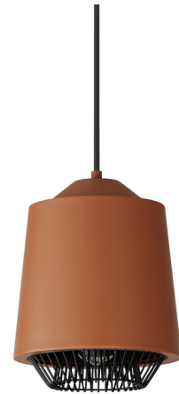
Shown in black / brick red

PRODUCT DIMENSIONS . . . . . Min/Max Adjustable Length: 12.5" - 134.5" COLOR RENDERING . . . . . 90 CRI LAMP COLOR . . . . . 3000K LUMENS/WATT . . . . . 72.22 LUMINOUS FLUX . . . . . 650 lumens