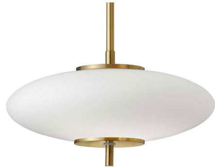
Shown in aged brass / opal white