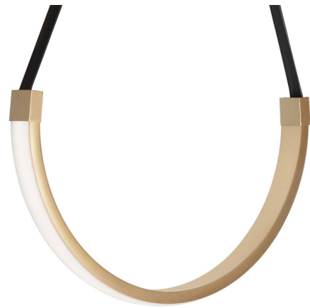
Shown in aged brass / white