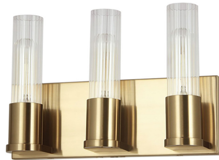
Shown in aged brass / clear

The Tube Bathroom Vanity Light indeed features a row of tubular glass shades set against a tall rectangular wall plate. The shades are held securely in place by similarly shaped cylindrical metal holders. The holders and the vertical fluting adds to the overall sense of height and scale, ensuring a grand presence over the mirror in a bathroom or powder room.