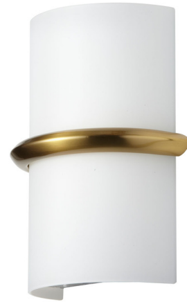
Shown in aged brass / opal white

LAMP LIFE . . . . . 30000 hours COLOR RENDERING . . . . . 90 CRI LAMP COLOR . . . . . 3000K LUMENS/WATT . . . . . 64.29 LUMINOUS FLUX . . . . . 900 lumens